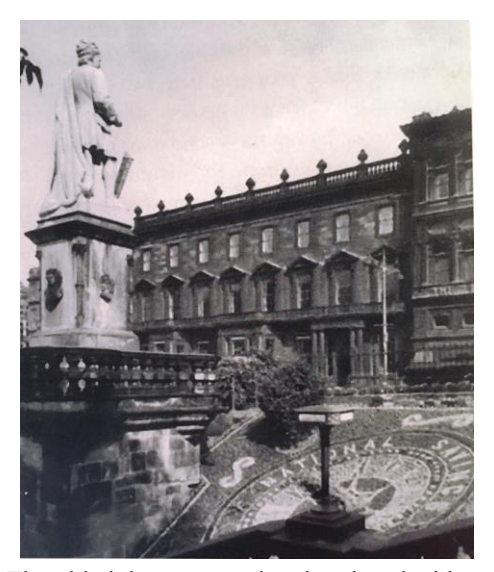
The old club, now razed and replaced with...