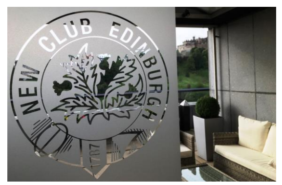
The club's balcony door; note Edinburgh Castle in the distance