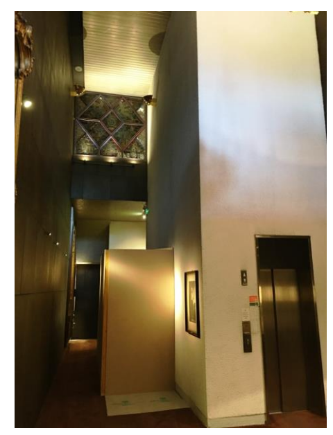
The even stranger interior entrance