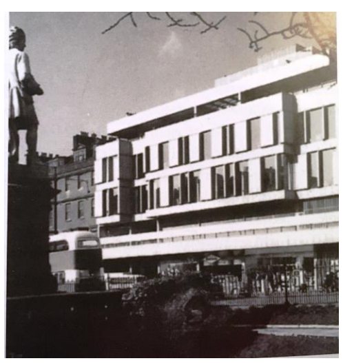
...this glorious example of 1960s architecture