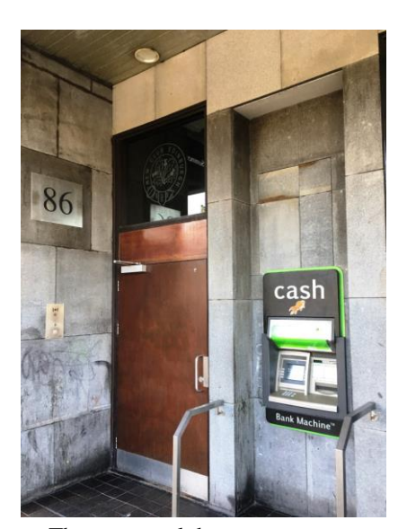
The strange club street entrance; cash is at the ready