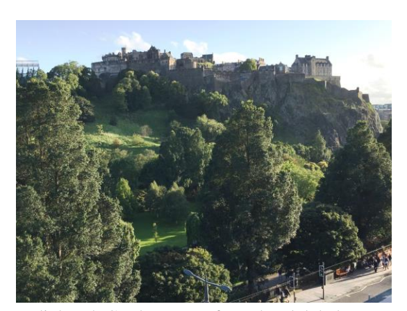
Edinburgh Castle as seen from the club balcony